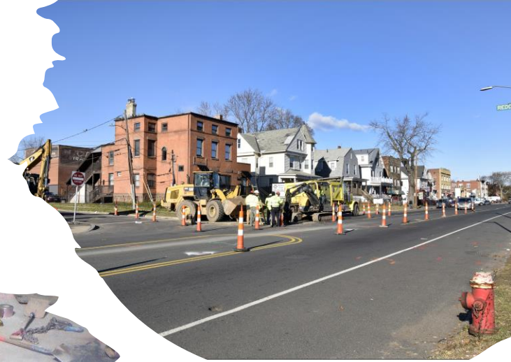
Bond Street Area Water Main Rehabilitation Project 11/11/11