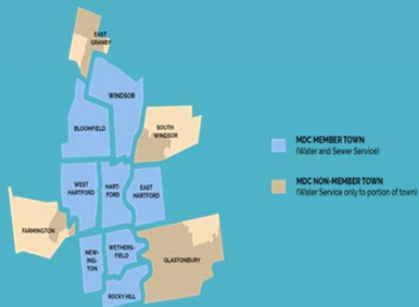
THE METROPOLITAN DISTRICT MAIN SERVICE AREA