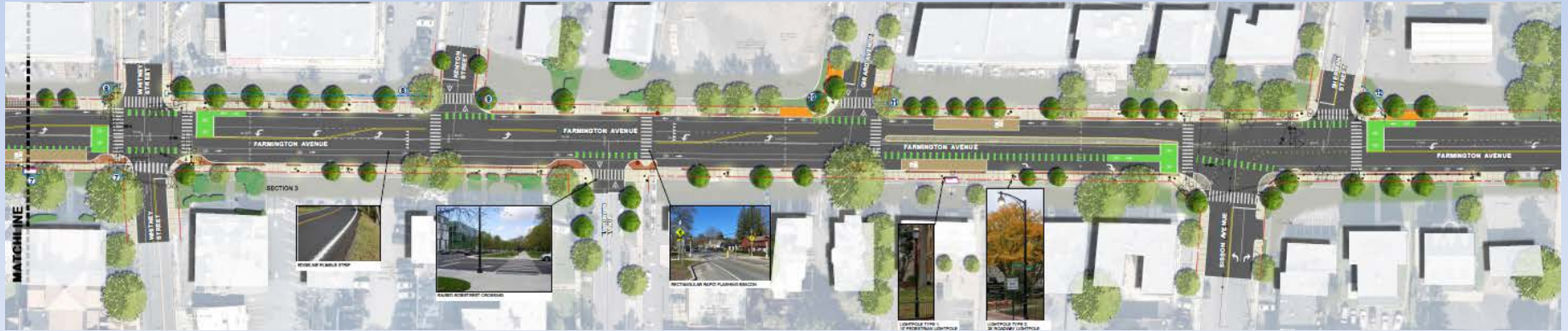
Streetscape Project from Prospect Ave to Denison St