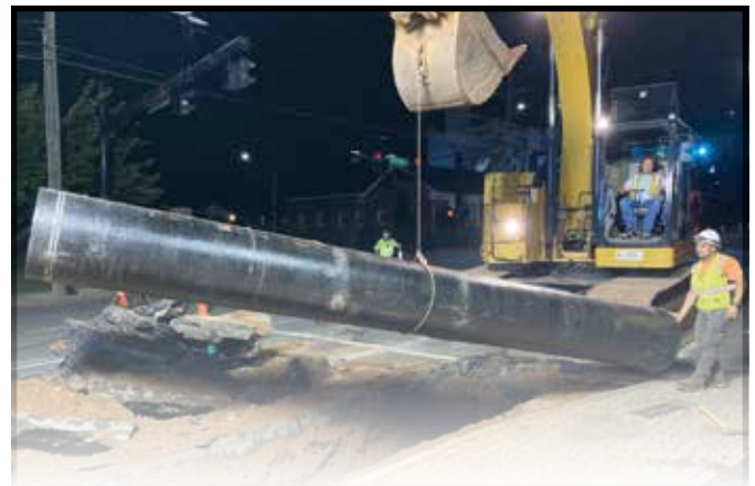
The Metropolitan District installing a 24-inch water main.

F armington Avenue is a well-known commercial thoroughfare in downtown West Hartford, CT. This area is a destination for shopping, dining, and entertainment. It also links other nearby towns to downtown Hartford. The Metropolitan District (MDC) owns and operates the water mains in this area and had previously replaced water mains along Farmington Avenue in downtown West Hartford. These prior projects included the areas west of the Walden Street intersection and east of the Trout Brook Drive intersection but excluded the busier West Hartford Center area. Between those two intersections, water service was still provided by two 20-inch unlined cast iron mains more than 140 years old.