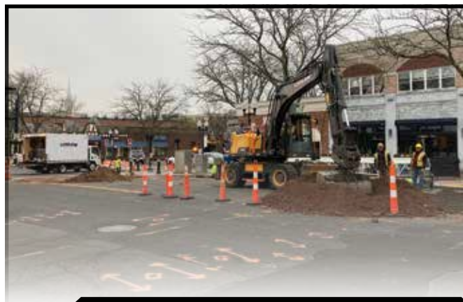
The Metropolitan District installing a 24-inch water main.

The project was broken into four phases that could be constructed, disinfected, and put into service individually. Phase 1 between Dale Street and the north and south main streets was phased in a way that it could be "looped" and put into service prior to completion of subsequent phases. Phase 1 contained most of the outdoor dining locations and was the primary driver of the expedited schedule. This phased approach was not the original construction phasing strategy, but it was necessary to rethink phasing due to the expedited project schedule.