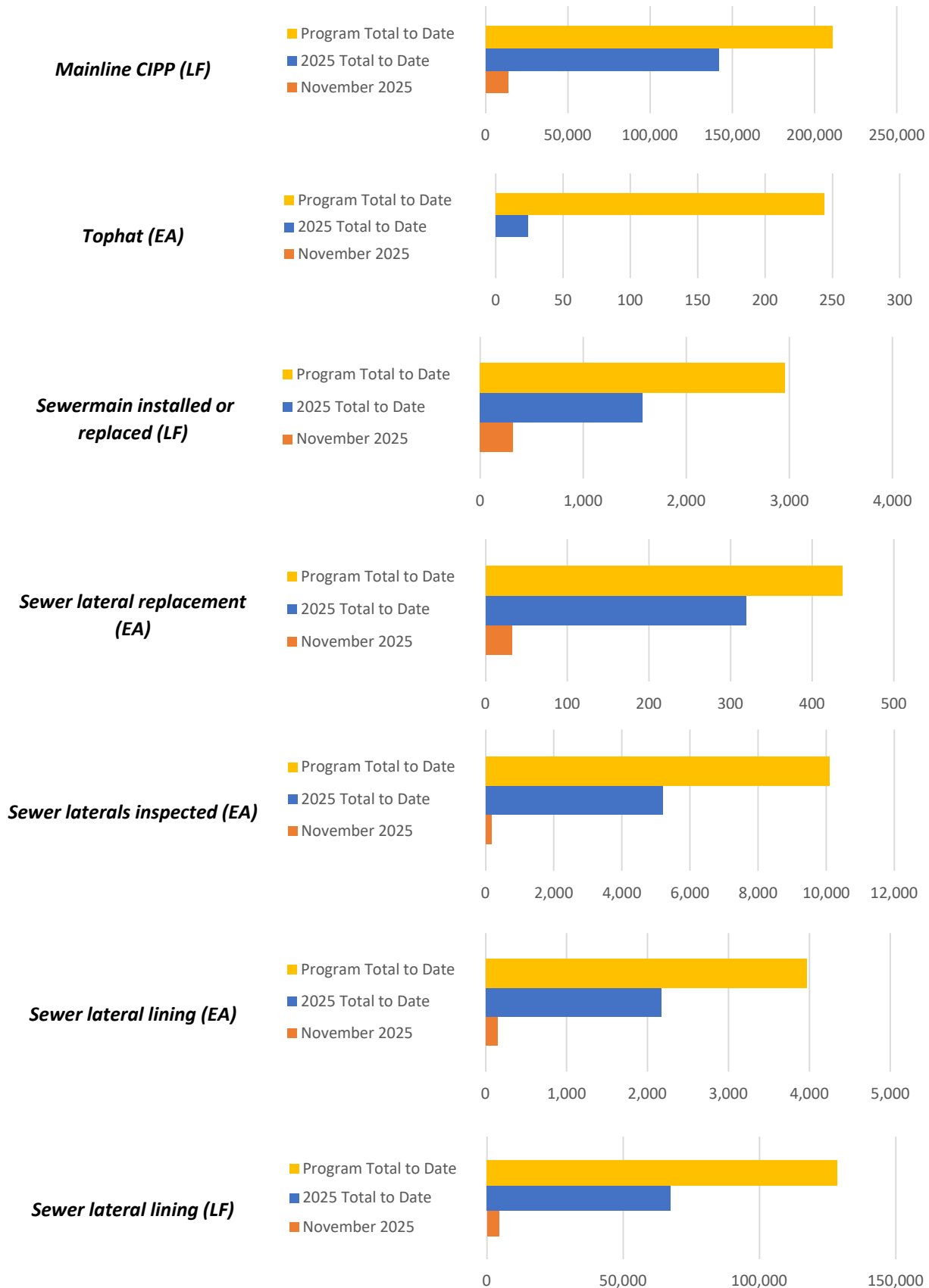
Figure 1: Summary of Repairs, Improvements, and Expenditures for 2025 Public Act No. 23-204 / House Bill No. 6941 Monthly Report for November 2025 Activities